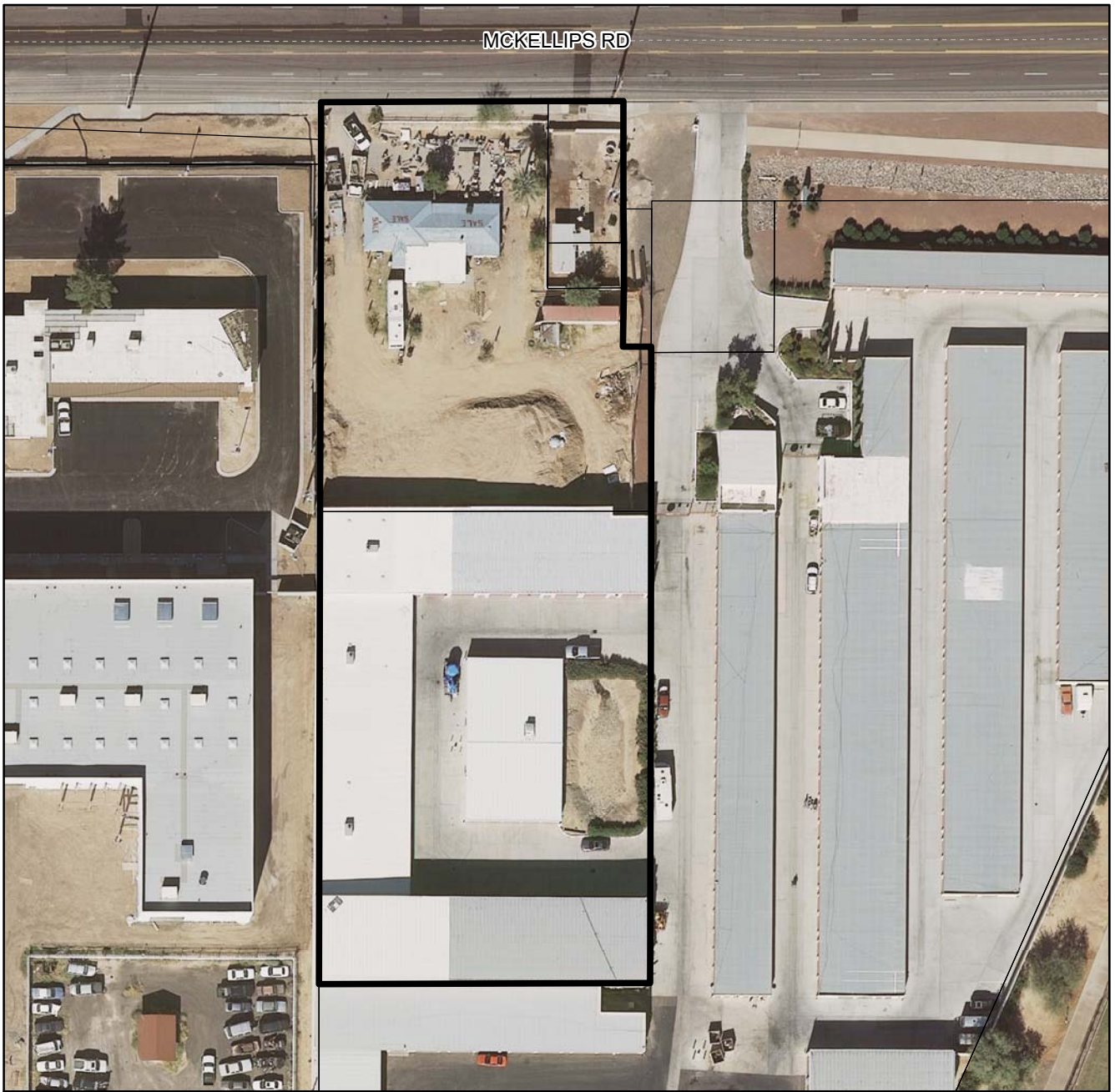
1407 E MCKELLIPS (PL110395)